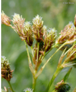
Keir Morse (2008)