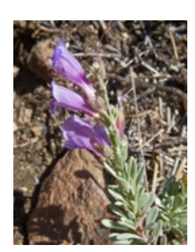
Neal Kramer 2009