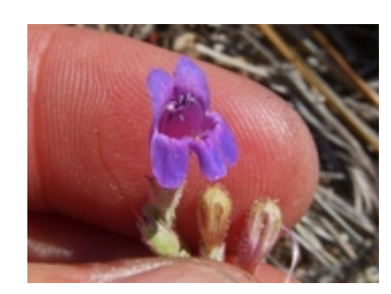
Neal Kramer 2009