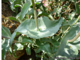
Keir Morse 2015