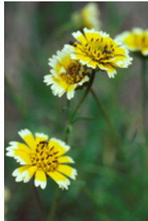
© 1980 California Native Plant Society © 2011 Chris Winchell